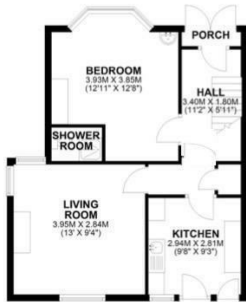
GROUND FLOOR APPROX. 50.8 SQ. METRES (546.6 SQ. FEET)